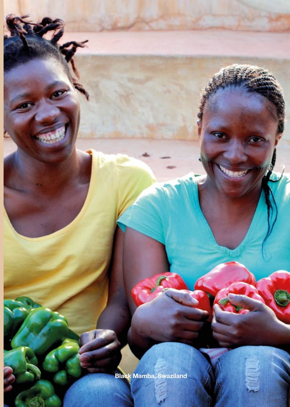
Black Mamba, Swaziland

After remembering your family and loved ones in your Will you could leave a gift that will make a lasting difference to people's lives and future generations.